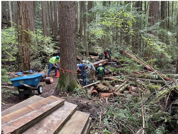
Above: Volunteers working on the Snoquera Falls Bridge repair.