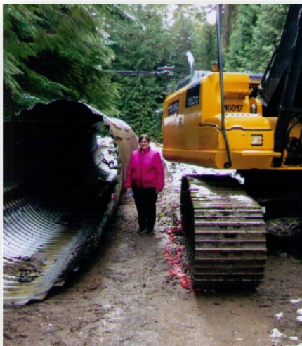
Goat Creek culvert after removal

Also, incredibly many cabins are transitioning to their 2nd, 3rd and possibly 4th generation of owners. WRRRA is a great way to share the legacy and start sharing responsibility of cabin ownership with our next generations! Please consider adding a least one membership to your cabin in 2018!